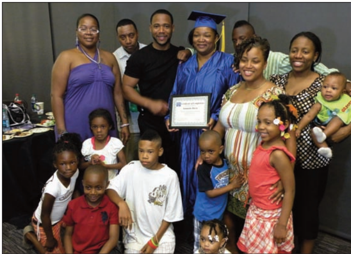
GED graduate and family.